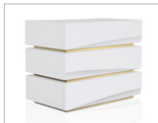
powder white & brass