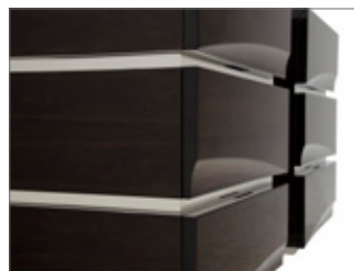
polished nickel risers