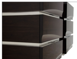
polished nickel risers