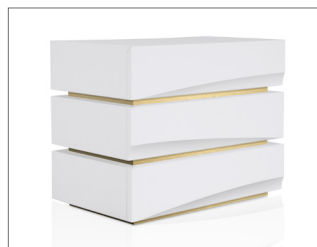
powder white & brass