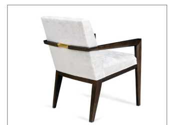
terrah arm chair