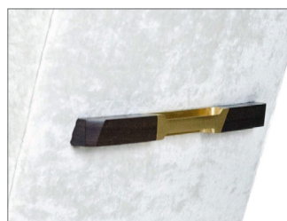
optional metal grab bar