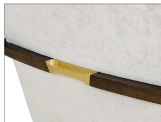
optional metal grab bar