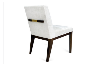
terrah side chair