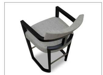
bar stool, ebonized walnut