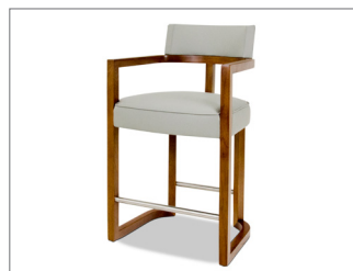
counter stool, brandy walnut