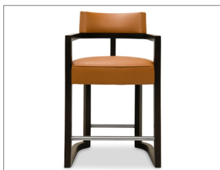
counter stool, cinder sapele